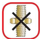
FILETTO CONICO TAPER THREAD