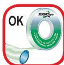
SILICON SEALING TAPE SILICON SEALING TAPE