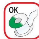
NASTRO P.T.F.E. P.T.F.E. BAND