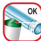
TWINE SEAL TWINE SEAL