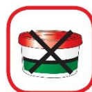
PASTA VERDE GREEN PASTE