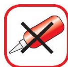
SIGILLANTI ANAEROBICI ANAEROBIC SEALANTS