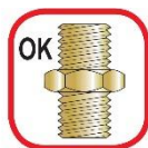
FILETTO PARALLELO PARALLEL THREAD