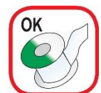
NASTRO P.T.F.E. P.T.F.E. BAND