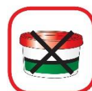
PASTA VERDE GREEN PASTE