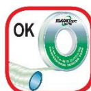
SILICON SEALING TAPE SILICON SEALING TAPE