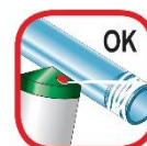
TWINE SEAL TWINE SEAL